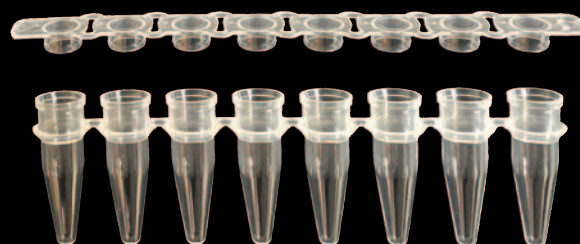
0.2ml PCR Strip Tubes and Caps