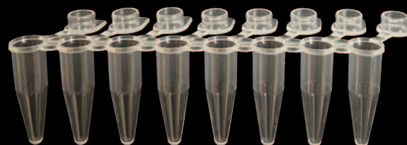
0.2ml PCR Strip Tubes with individual Caps