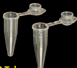
0.2ml PCR Tubes

NOVASBIO Tubes and StripTubes are produced using only the finest medical grade polypropylene and certified free from DNase, RNase and Human DNA.